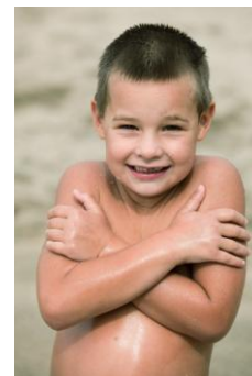
Figure 2 Shivering helps this boy's body to warm up.

Feed forward mechanisms anticipate changes in a variable, improving the speed of homeostatic response. For example, presence of food in the intestine stimulates secretion of hormones that promote cellular uptake and storage of the food which is about to be absorbed into the bloodstream.