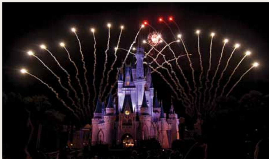
Fireworks display behind Disneyland's Cinderella castle

early Disney research, the company has gone on to pioneer the use of high-nitrogen compounds for indoor pyrotechnics, used for example in concerts and theatres.