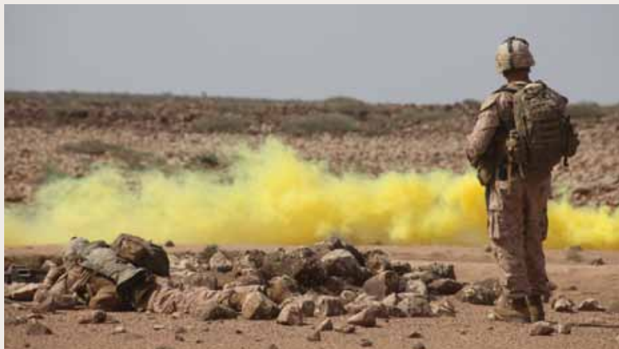
Yellow smoke flare marking out a landing zone for a military helicopter

The challenge in developing effective military smoke-releasing flares is to produce items with a sufficiently short burn time, producing high volumes of smoke for 15 seconds or less – but that don't burn so hot that they decompose the dye.