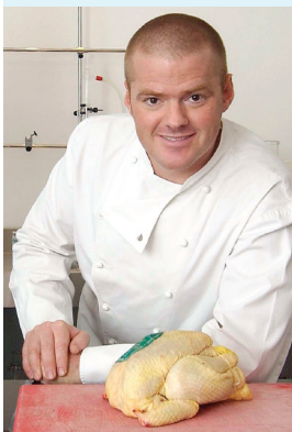
This is Heston Blumenthal. He is a food scientist who uses kitchen chemistry to create innovative foods. He is also a Fellow of the Royal Society of Chemistry.