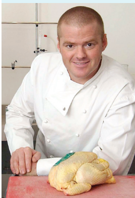
Heston Blumenthal is a food scientist. He uses kitchen chemistry to cook food in new ways.