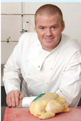
This is Heston Blumenthal. He is a food scientist who uses kitchen chemistry to create innovative foods. He is also a Fellow of the Royal Society of Chemistry.