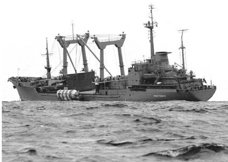
Russian 'Mikhail Rudnitsky' vessel lowers rescue capsule