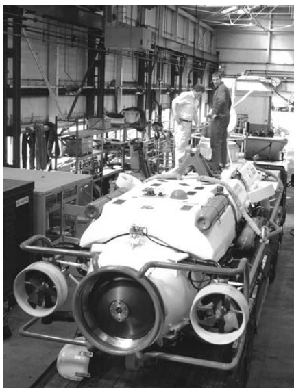
UK submarine rescue service go through final checks on their rescue submersible