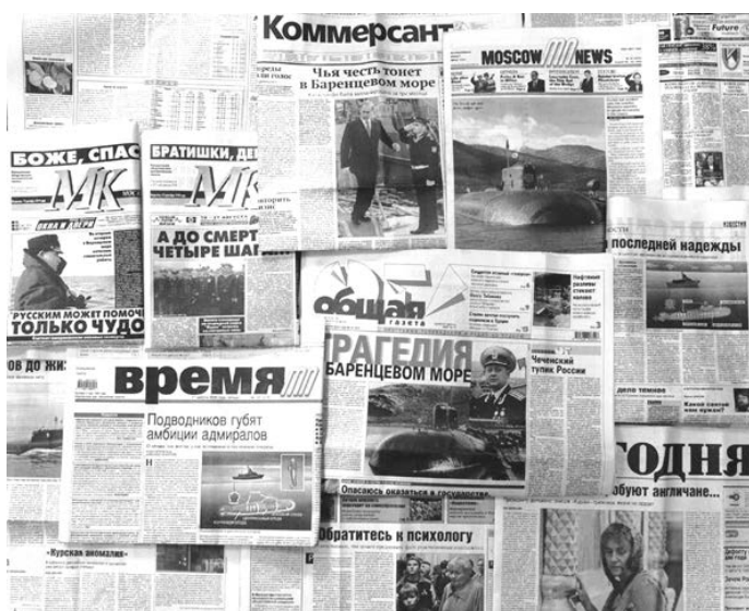
The Kursk dominates the front pages of Russian newspapers, 17 th August 2000