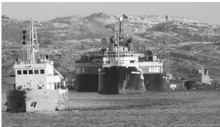
A tugboat tows the barge with the Kursk nuclear submarine beneath

The remains of the Kursk submarine are lifted from the seabed by a Dutch salvage team. The submarine, carrying two nuclear reactors and 22 missiles, was attached to a giant barge and towed towards Murmansk in northern Russia. The front was cut off and left on the seabed.